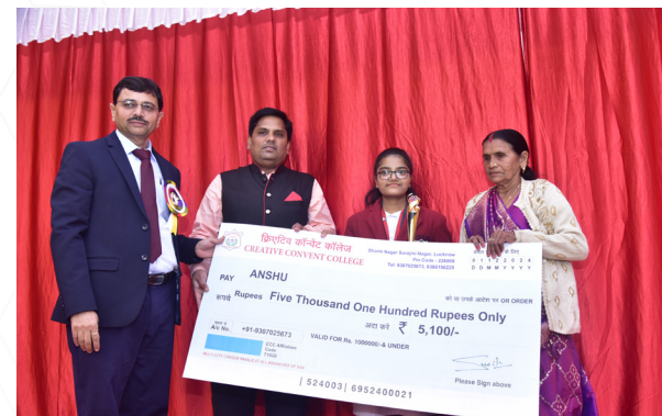
DN Samhal IPS Memorial Award