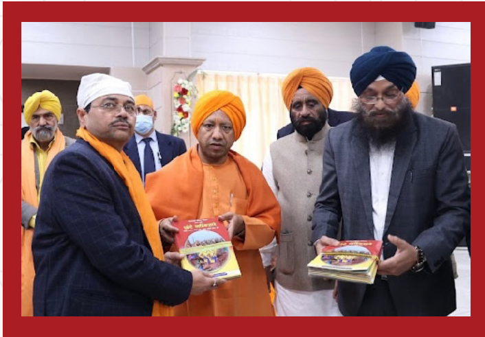
Hon'ble C.M Yogi Adityanath (C.M.-U.P)