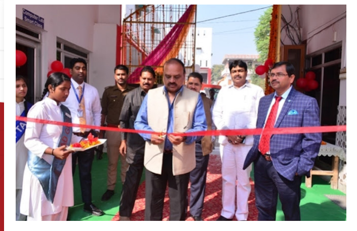
Hon'ble MP Jai Prakash Rawat (Member of Parliament)