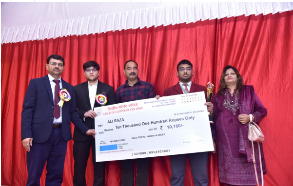
Rakhi Sachan Legacy Award