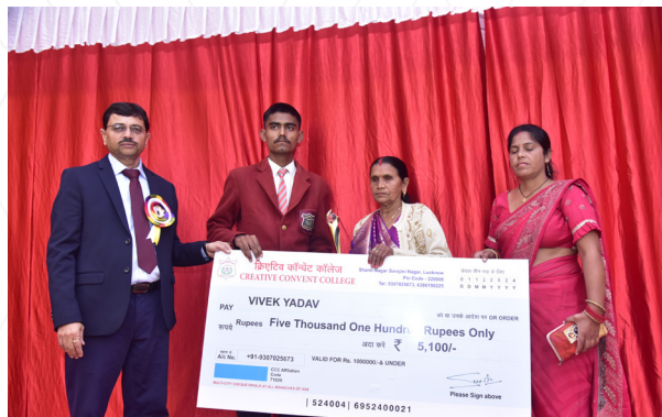
DN Samhal IPS Memorial Award