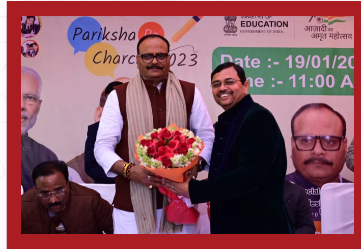
Hon'ble Dpt C.M Brijesh Pathak (Deputy C.M.-U.P)